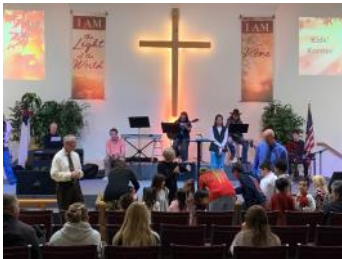
Pastor Appreciation - Aztec