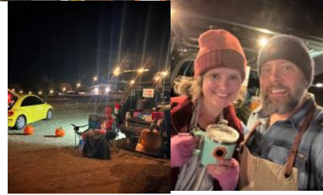
Living Stones CON Trunk or Treat/ Movie Night