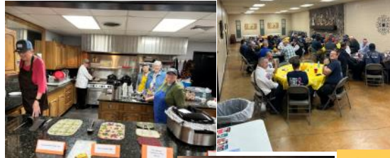
Living Stones CON 1st Responders Breakfast