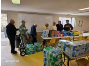
Gallup 1st -work team from Rio Rancho