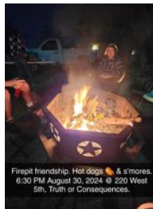
T or C