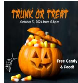
Las Cruces 1st