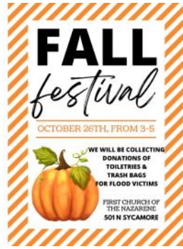
Roswell 1st CON