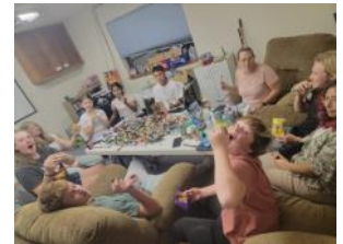
La Vista Teens at Lego party