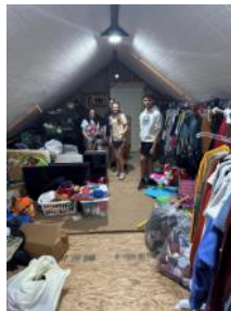
Portales Teens helping out at Hope Harbor