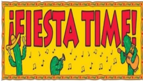
Angus Church of the Nazarene

CRCC NAZ Farmington Christmas Gathering! Following church Dec 5. If you signed up to bring Enchilada's or Cobbler, don't forget them.