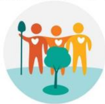
Community Service Project at the church at 10 am

The La Vista Teens made gingerbread houses!